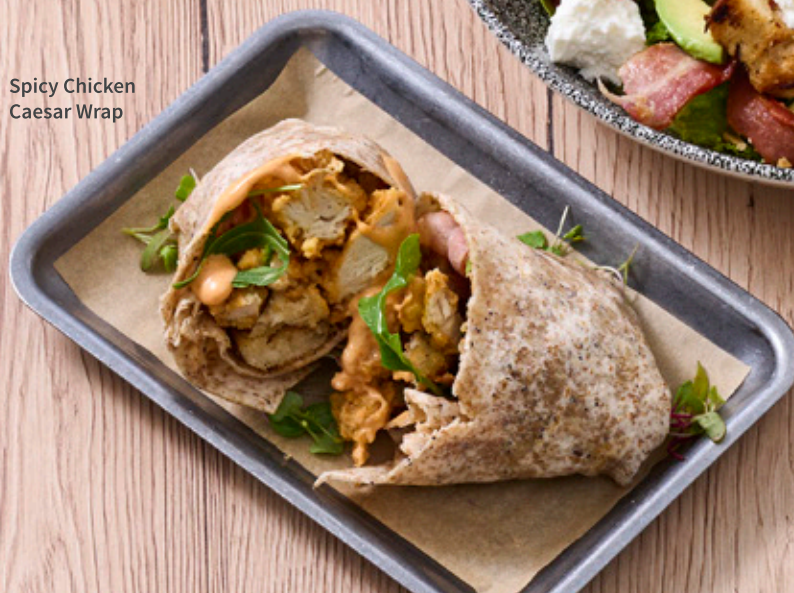
Spicy Chicken Caesar Wrap