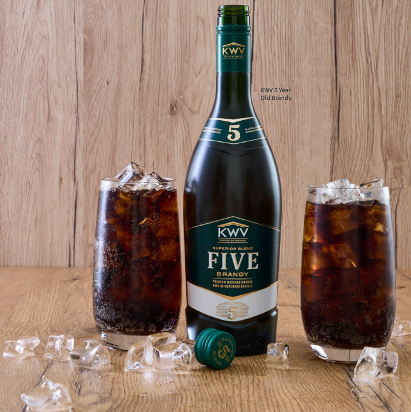
KWV 5 Year Old Brandy

ALCOHOL NOT FOR SALE TO PERSONS UNDER THE AGE OF 18