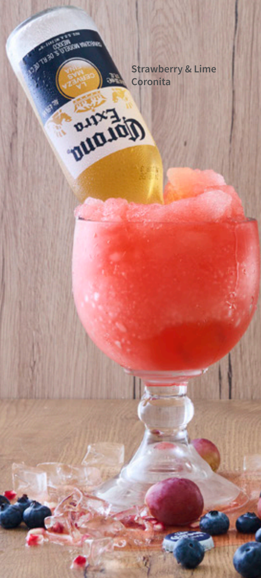
Strawberry & Lime Coronita