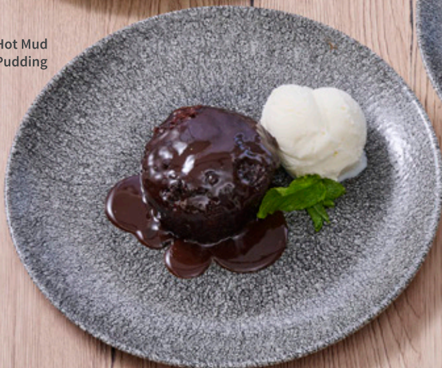
Hot Mud Pudding