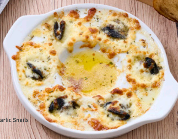
Cheesy Garlic Snails