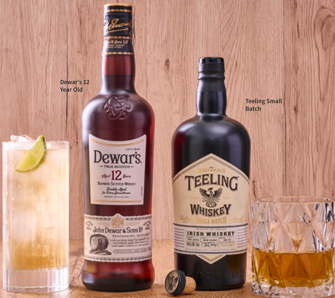
Dewar's 12 Year Old