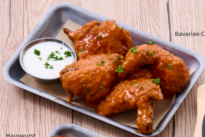
Bavarian Chicken Wings