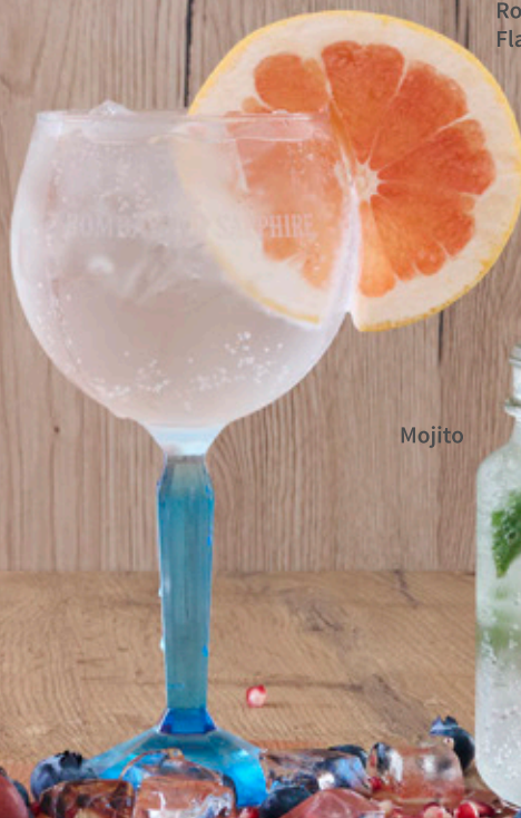
Rose & Grapefruit Flavoured Gin & Tonic