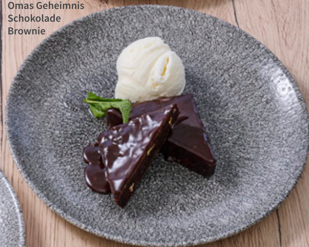
Omas Geheimnis Schokolade Brownie